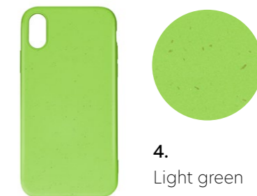
4. Light green