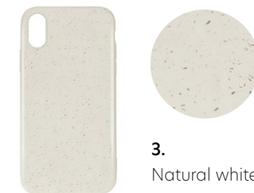
3. Natural white